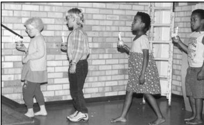
CHRISTINGLE START OF THE CHRISTMAS PAGEANT